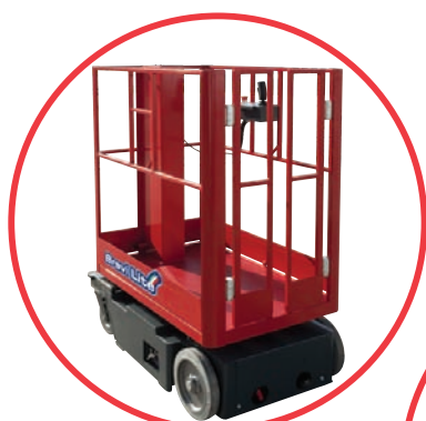
Compact & Powerful