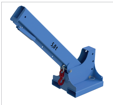
KTH-K at an elevated working height