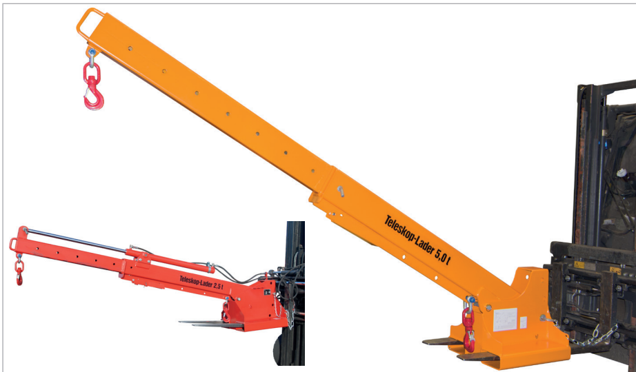
Hydraulic extension function (KTH)