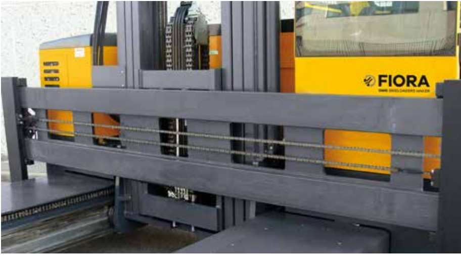
Wide fork carriage and hydraulic fork spreader allow to carry long materials, stabilizing the load.