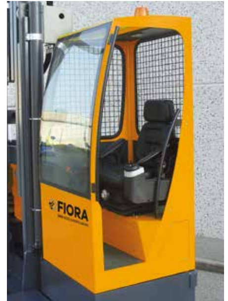
Front drive cabin, ergonomic and fully adjustable seat, lined with sturdy hypoallergenic material. The anchorage handles make the access to the cabin easy and safe.