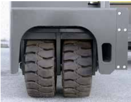
Large diameter wheels in Super Elastic rubber: to operate within industrial buildings and on asphalted floorings. Electromagnetic brakes ensure fast response to the stop command.